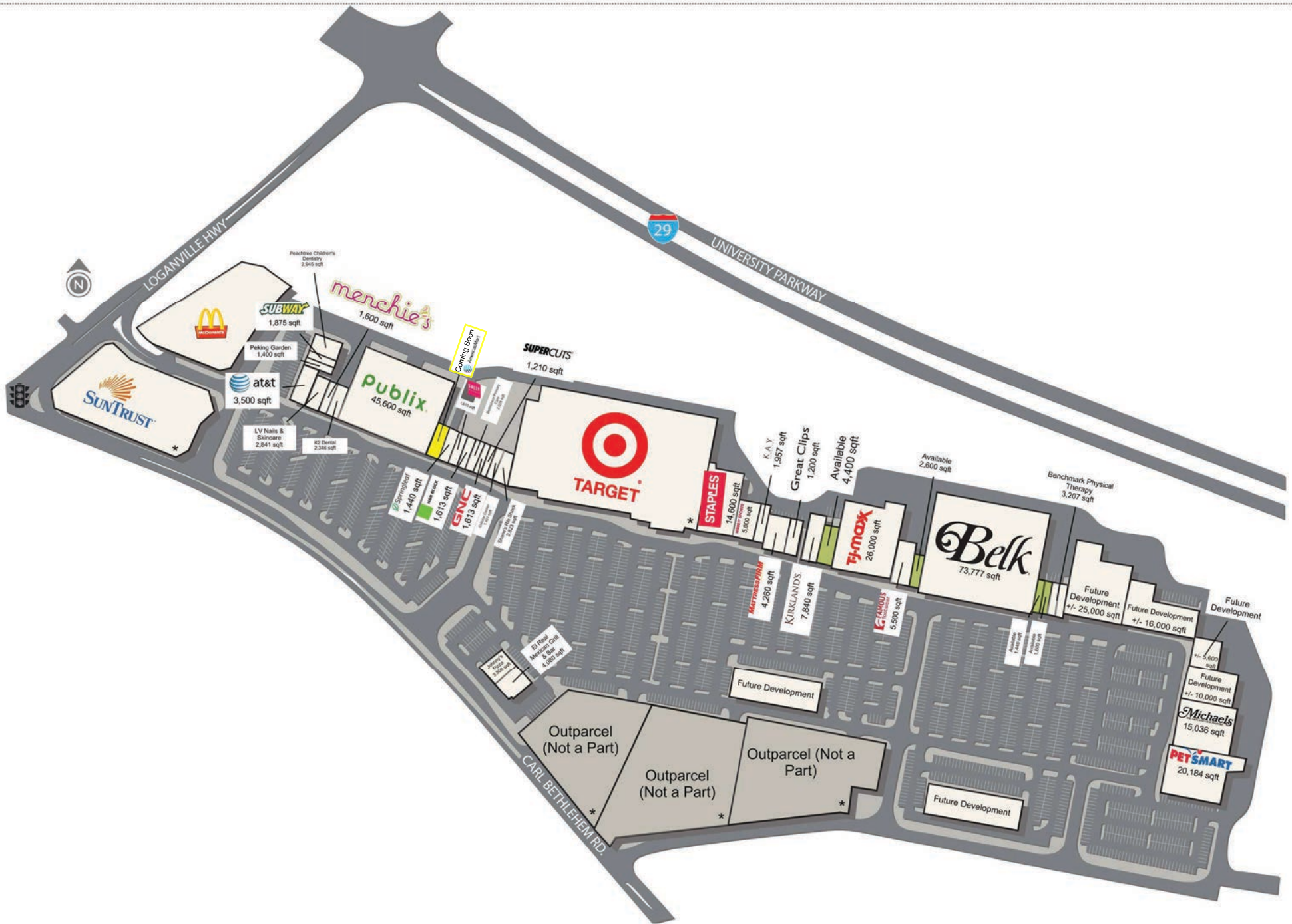
Property Lineup and Square Footage